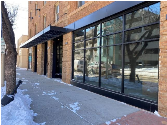
Prince Hotel 114 North 3rd Street (pending) Investment: $0.8 Million (estimate)