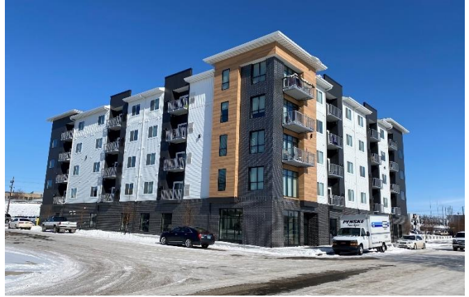
First Street Lofts 215 South 1st Street Investment: $7.4 Million