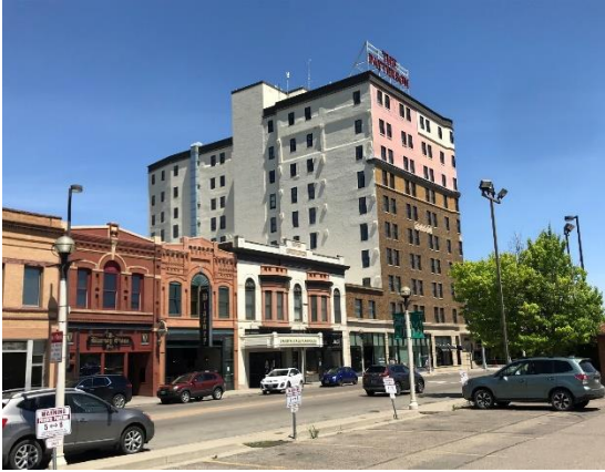
The Patterson 420 East Main Investment: $10.5 Million