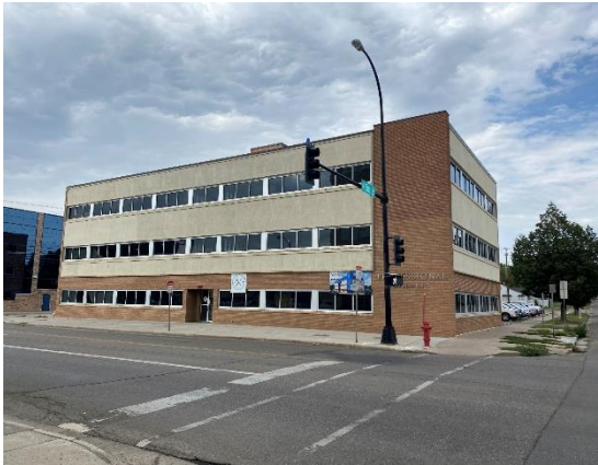
Professional Building 418 East Rosser (pending) Investment: $2.5 Million (estimate)