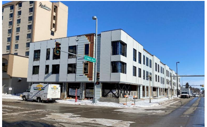
Trestle 630 East Main Ave (pending) Investment: $8.2 Million (estimate)