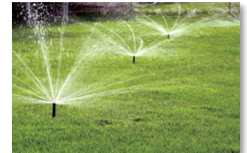
Irrigation System Efficiency: 90%