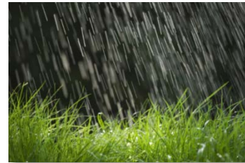
Beneficial Rainfall: 15 Inches