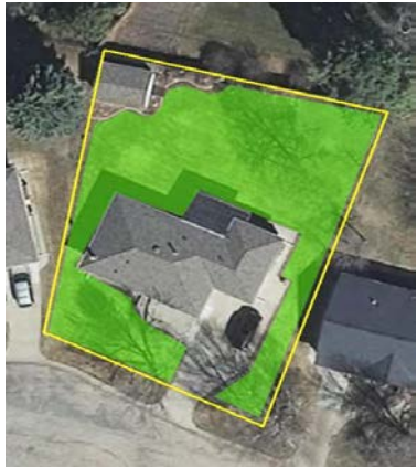
Parcel Size: 10,500 Landscape Area: 5,000