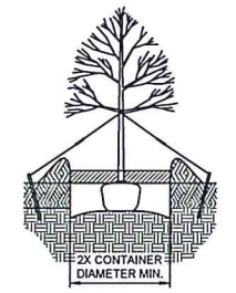
2 DECIDUOUS TREE PLANTING DETAIL C300 NOT TO SCALE