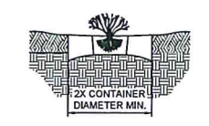
1 SHRUB PLANTING DETAIL C300 NOT TO SCALE